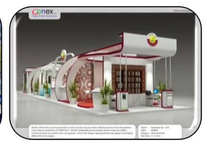
GI Fair, Women Innovators