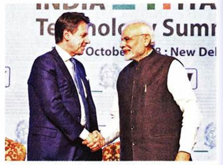
Prime Minister Narendra Modi and Italian PM Giuseppe Conte at India-Italy Technology Summit in New Delhi on Tuesday.

The highlight of the daylong visit is the Italian PM's participation at the 24th edition of the India-Italy Tech-