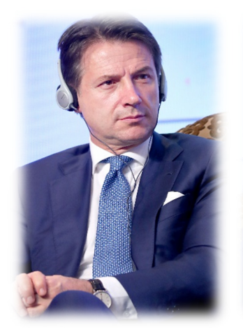
H.E. Giuseppe Conte Hon'ble Prime Minister of Italy