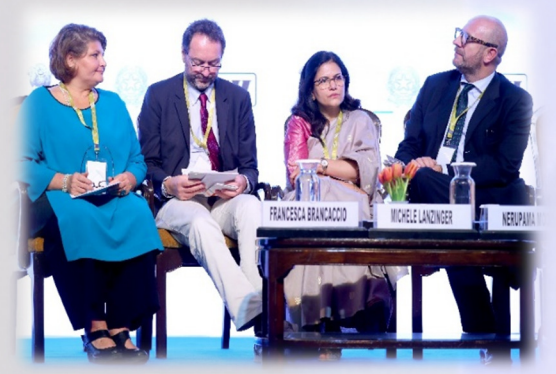
Cultural Heritage session focused on technologies for preservation & restoration of cultural heritage & monuments, tourism, museums & art galleries