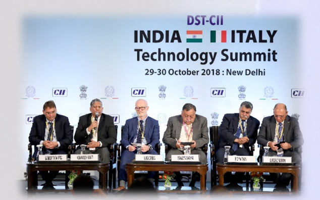
Renewable session focused on solar power, wind power, biomass, smart grids & smart metering