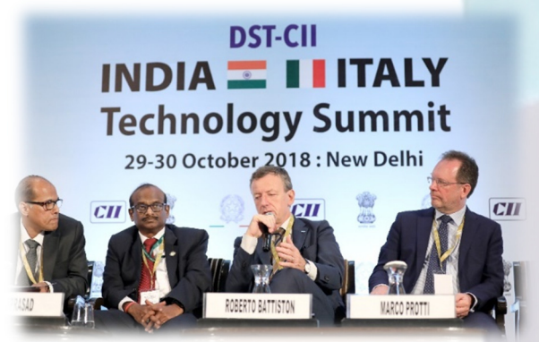
Aerospace session focused on satellites, launch vehicles, space derived services, aircraft components, MRO, aviation, air safety, air travel, airports

Here's the glimpse of various technical sessions held during Tech Summit.