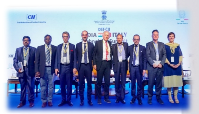
ICT session focused on telecom & broadband, E-commerce, IC manufacturing, VLSI, IOT