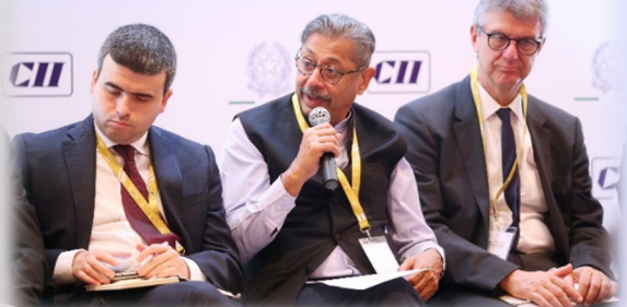
Healthcare session focused on healthcare, infrastructure, health insurance, diagnostics, medical devices, medicines, emerging trends, genomics, robotics